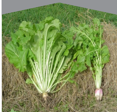
(Vivant on left, Purple Top on right)